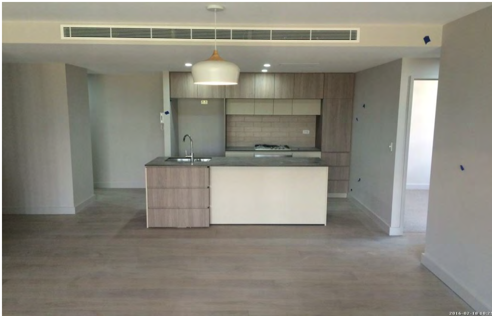
Photo 6: The below photo was taken on the 18 th February 2016, highlighting the complete installation of the 'light schemed' apartments, featuring the kitchen island and rear kitchen unit, stone benchtop along with the kitchen overhead cupboards, pantry door and kitchen sink / tapware and appliances (cooktop & oven).

Photo 5: The below photo was taken on the 18 th February 2016, highlighting the complete installation of the 'dark schemed' apartments, featuring the kitchen island and rear kitchen unit, stone benchtop along with the kitchen overhead cupboards, pantry door and kitchen sink / tapware and appliances (cooktop & oven). Some blue tags can be seen indicating minor defect works still to be completed.