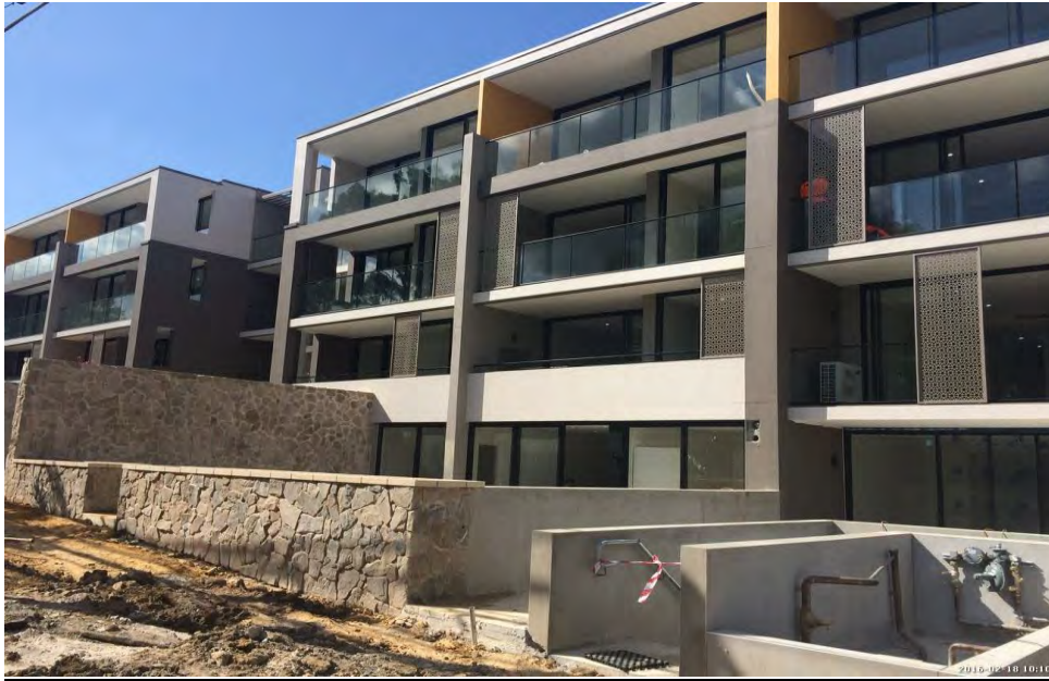
Photo 2: Shows the north eastern façade with vertical louvers some privacy screens.

Photo 1: Shows the northern façade with recently installed privacy screens. All external render and painting is completed. Final installation of the perimeter stone cladding and capping pieces to ground floor units is also visible.