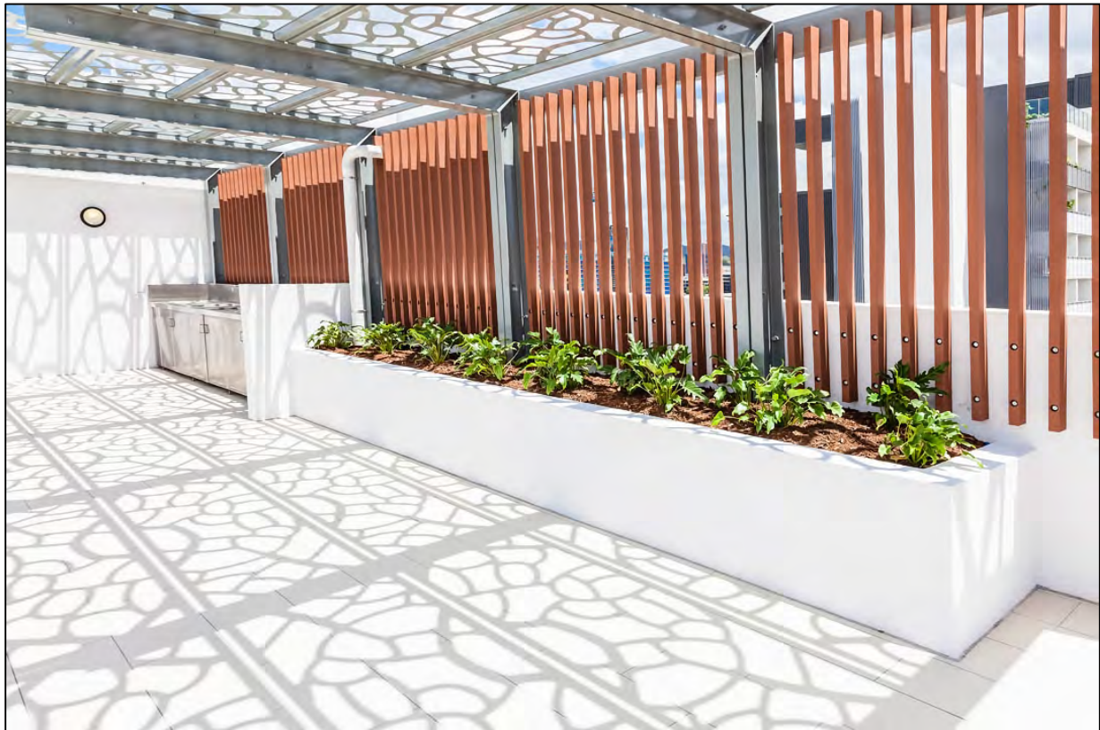
Figure 4: Fleet Lane roof top BBQ and Dining area. A high-end furniture package has been purchased and will be delivered prior to settlements.