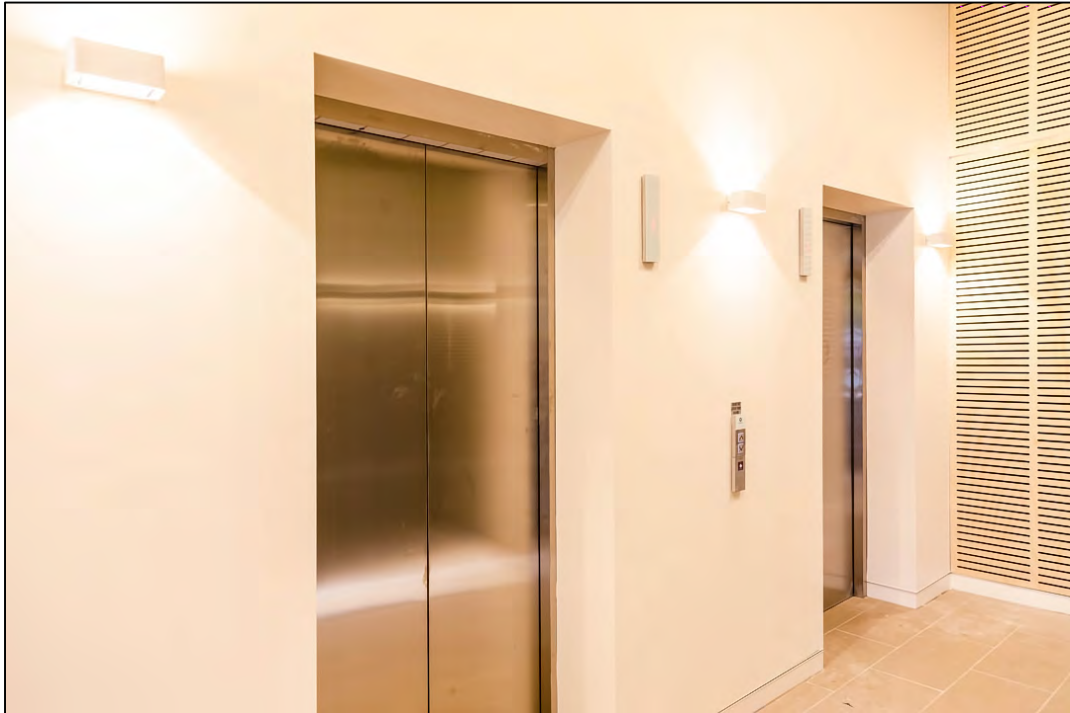
Figure 2: Fleet Lane Lift Lobby.