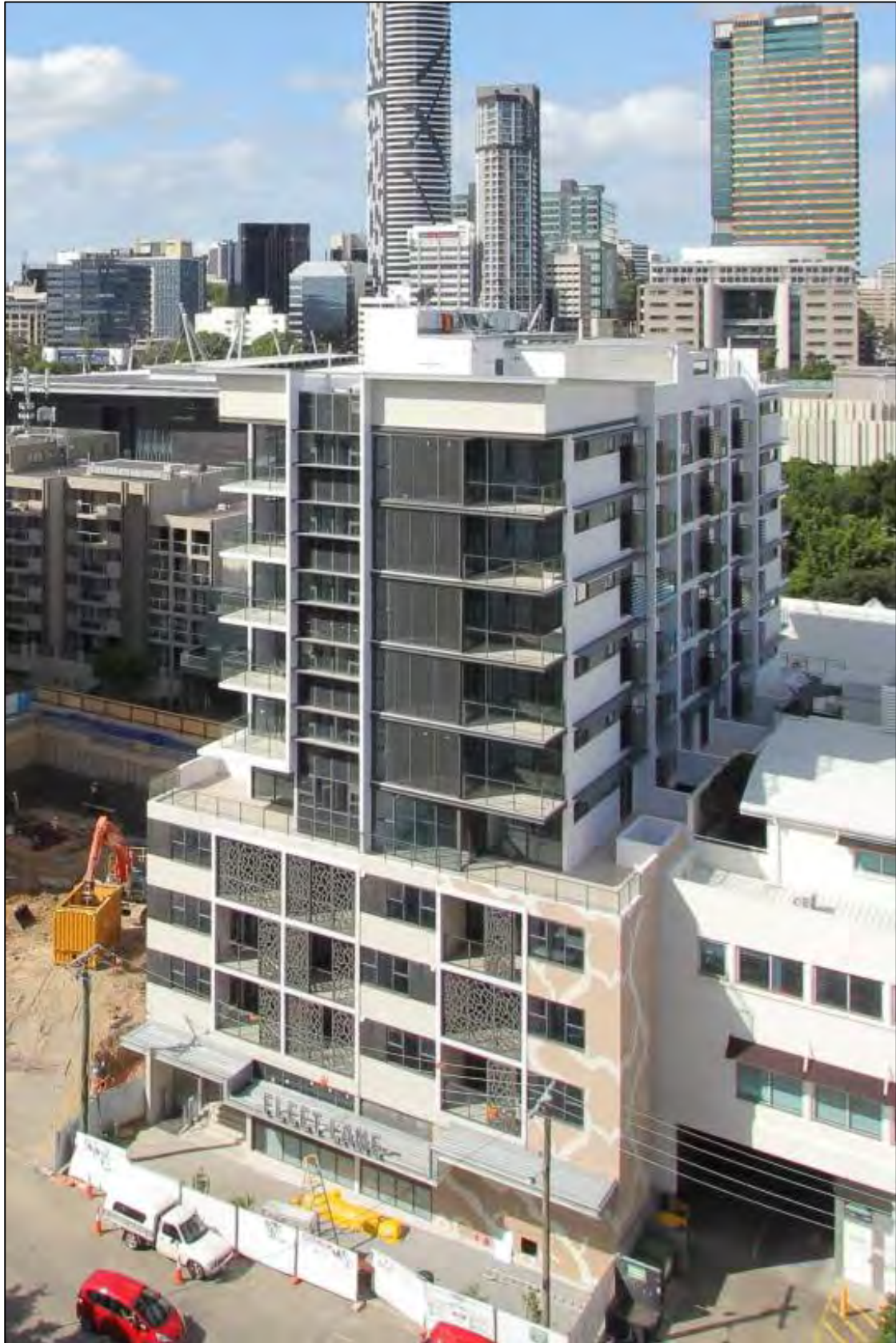
Figure 6: Fleet Lane 12 th February 2016