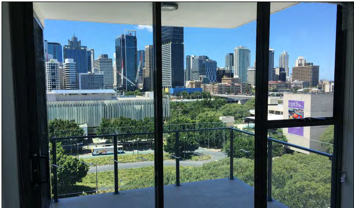
Figure 5: Master Bedroom views.