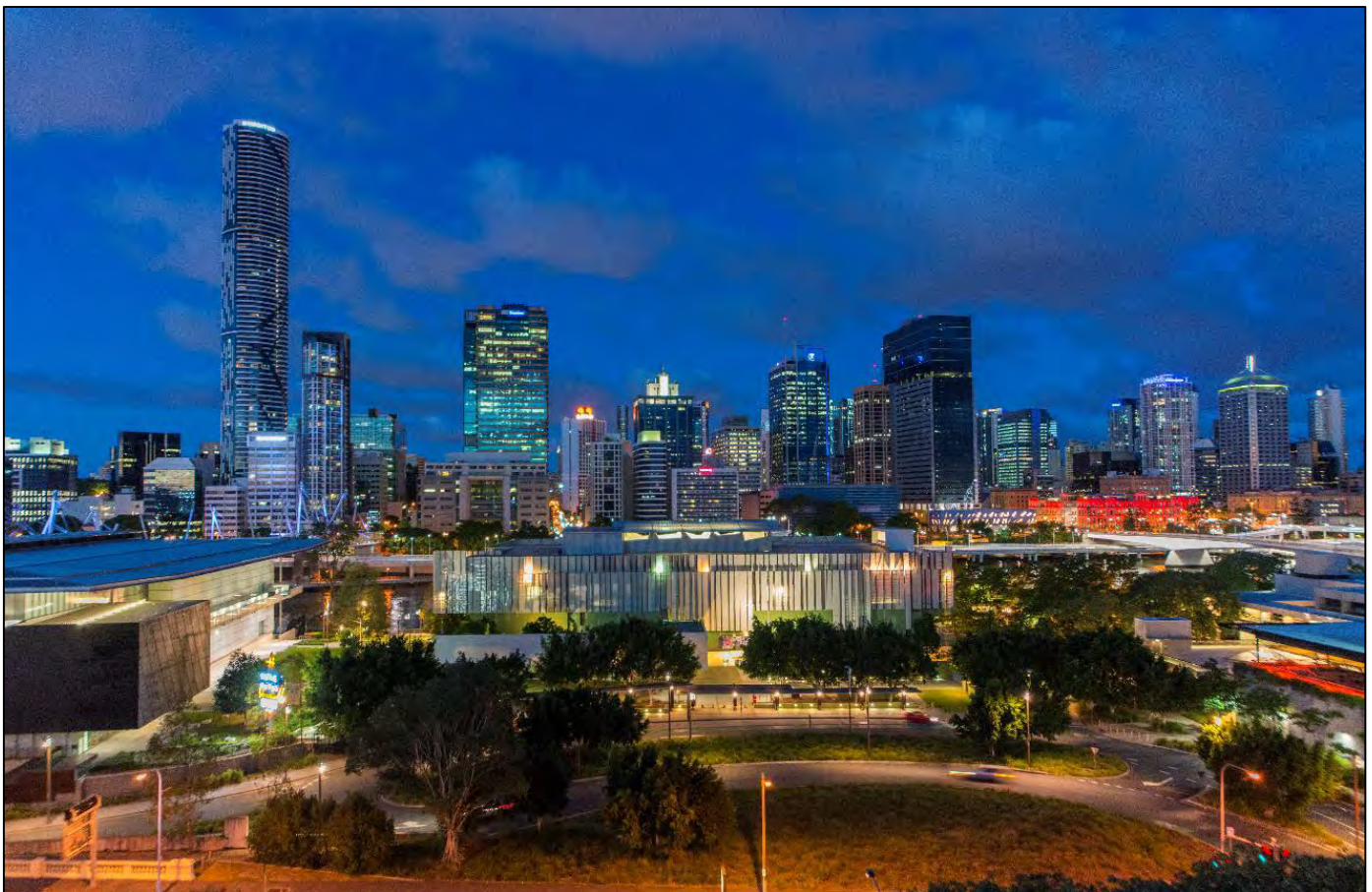
Figure 1: City view from Fleet Lane roof top entertaining area.