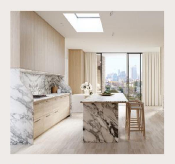
MONA - DARLING POINT 24 LUXURY APARTMENTS