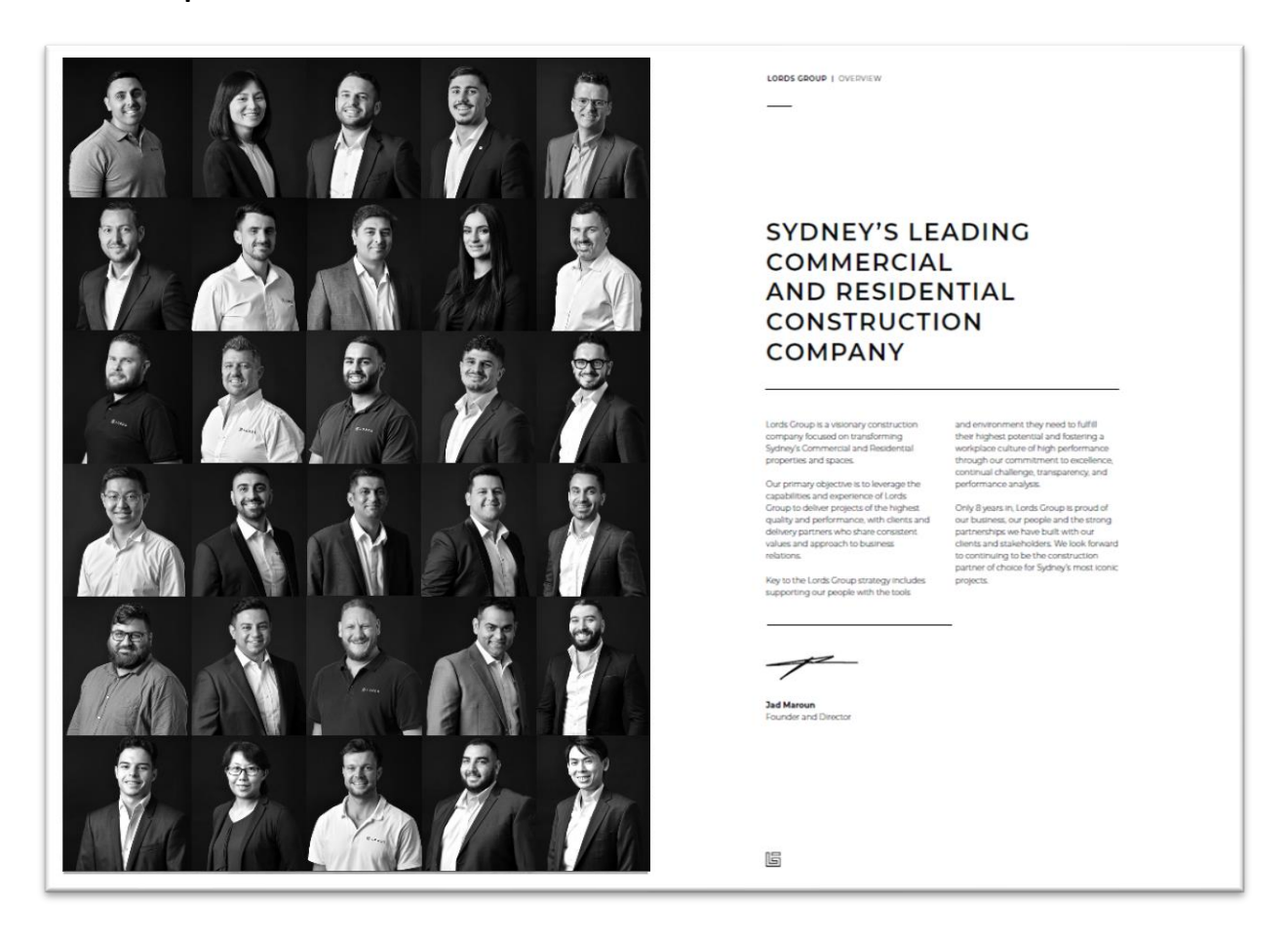
<u>Click here</u> to download the Lords Group Company Profile