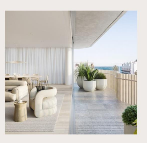
HALL ST - BONDI BEACH 17 LUXURY APARTMENTS