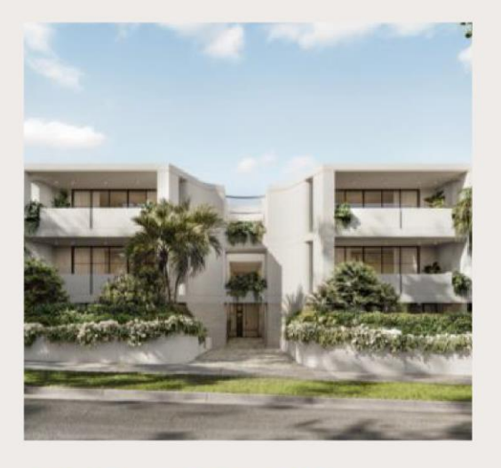
ATLAS - ROSE BAY 12 LUXURY APARTMENTS