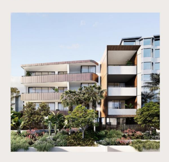
MARMONT - DOUBLE BAY 9 LUXURY APARTMENTS