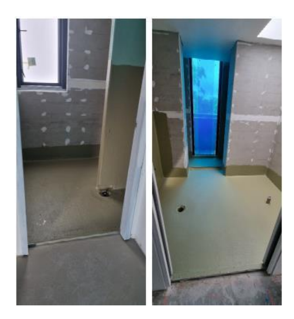
Waterproofing on Level 2 – 302 Ensuite