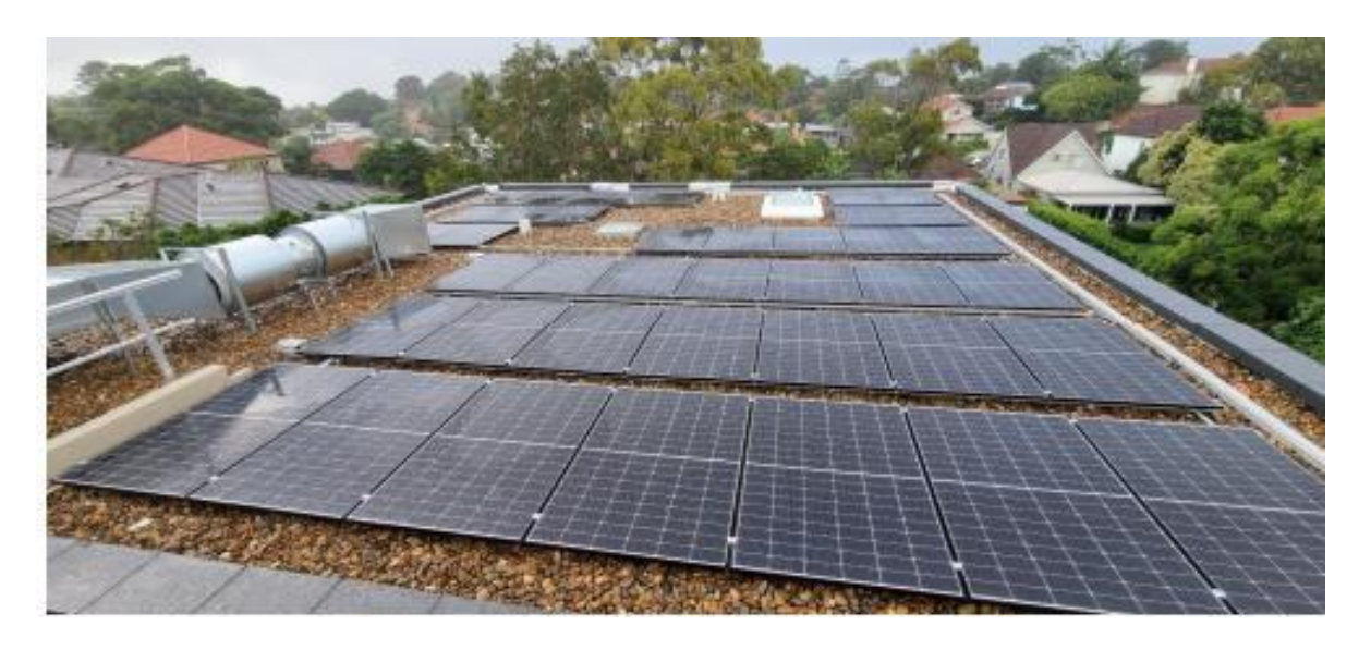
HVAC Services, Waterproofing, Baluster, Stone and Solar Panel Installation complete – Roof