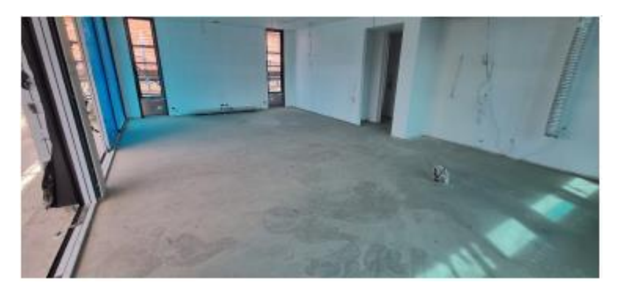
Floor Preparation & Topping completed on Level 2