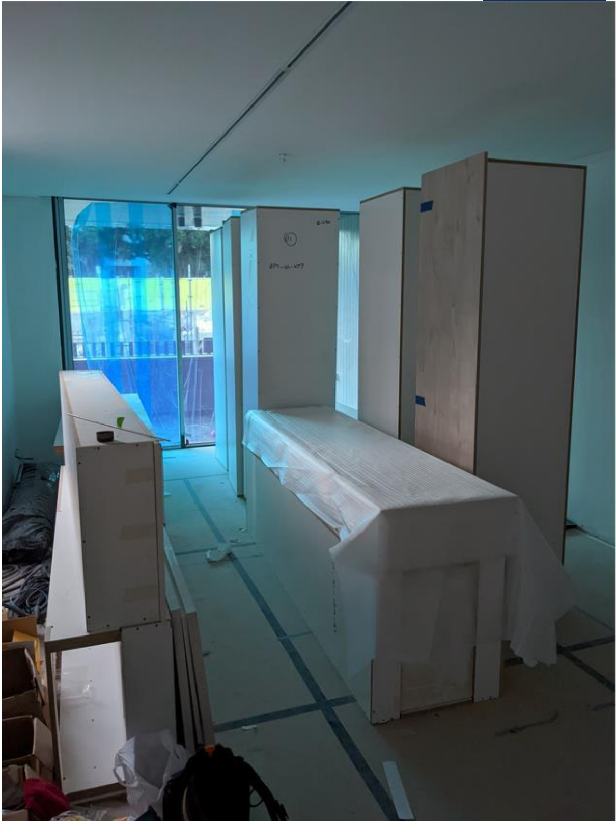
Apartment 104: Joinery delivery ready for installation