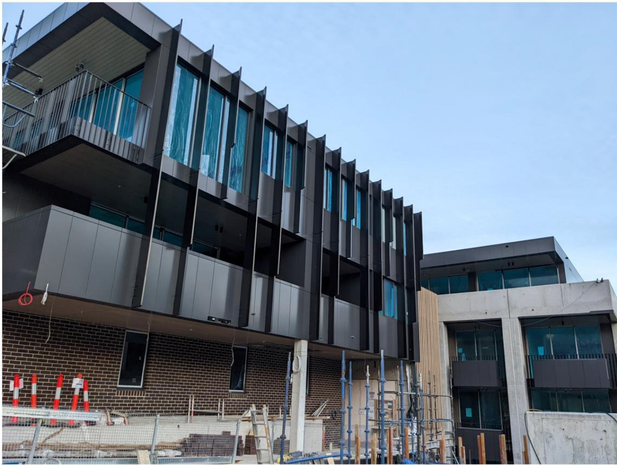
North-West Façade: Crane removed and view of masonry, aluminium cladding, and class 2 off-form concrete works