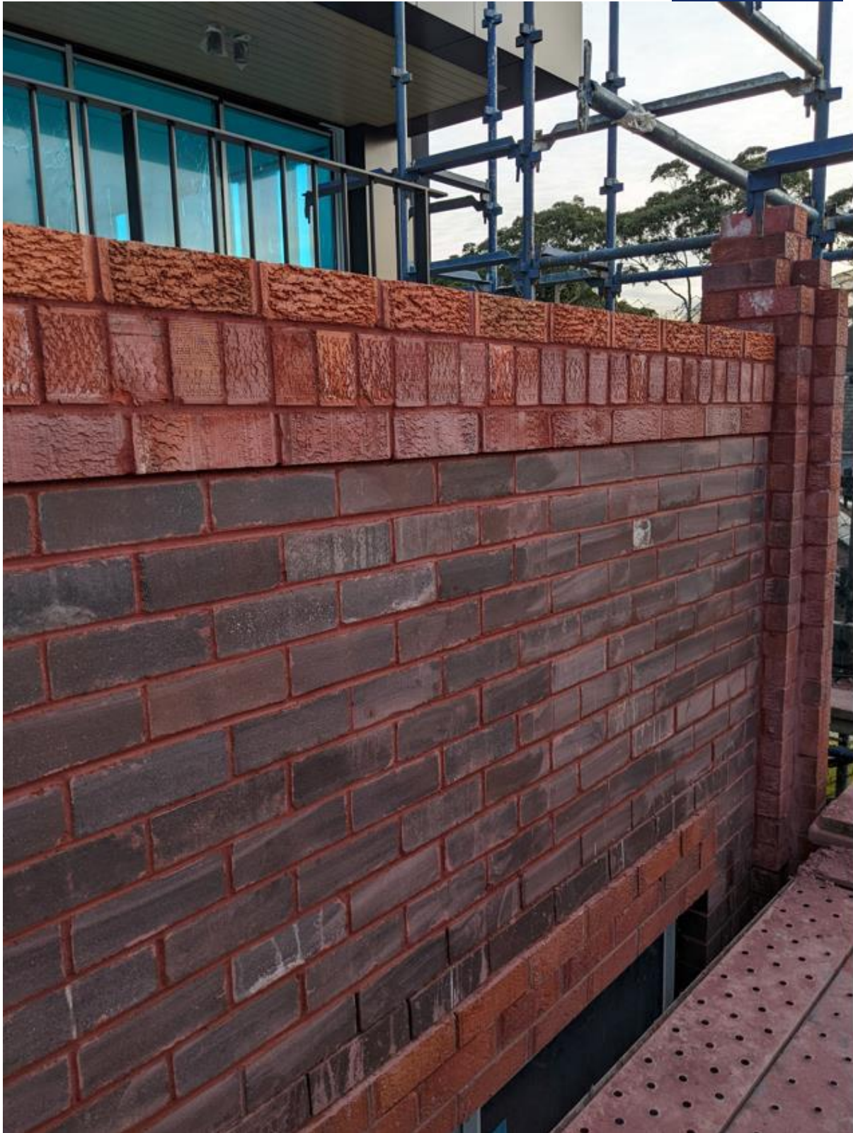
Northern elevation Level 1 to Level 2: Repointing of the Retained Facade