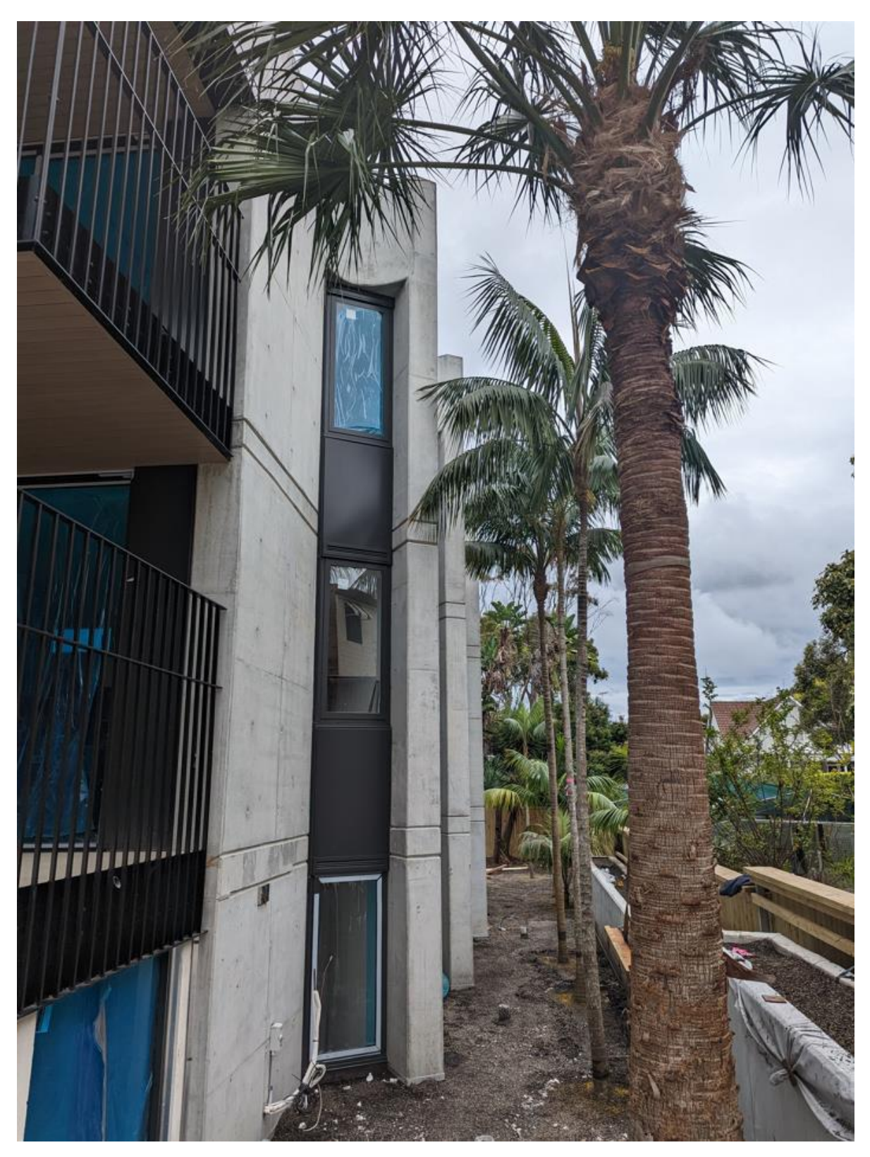
Palm Tree Installation on the Western Boundary