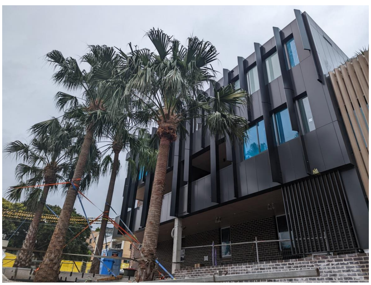
Western Façade finishes with Palm Tree Installation