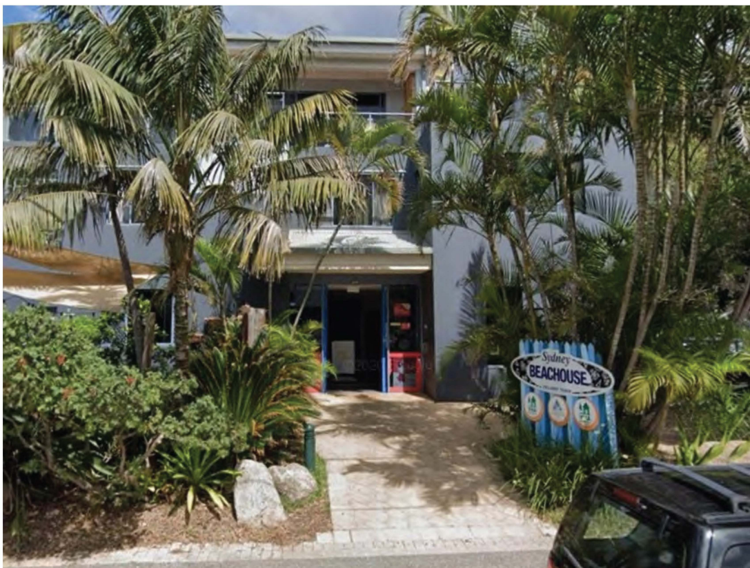
The Sydney Beachhouse backpacker hostel in Collaroy St, Collaroy.

But council planners said his redevelopment did not fit with the character of the area.