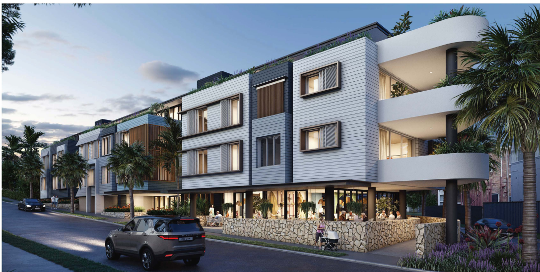
An artist's impression of the "Bathers Collaroy" redevelopment at Collaroy, looking west on Alexander St. Picture: HCAP Developments

Those against the redevelopment said it would massively increase local traffic; spoil views of the ocean and; that its rooftop terrace would invade neighbours' privacy.