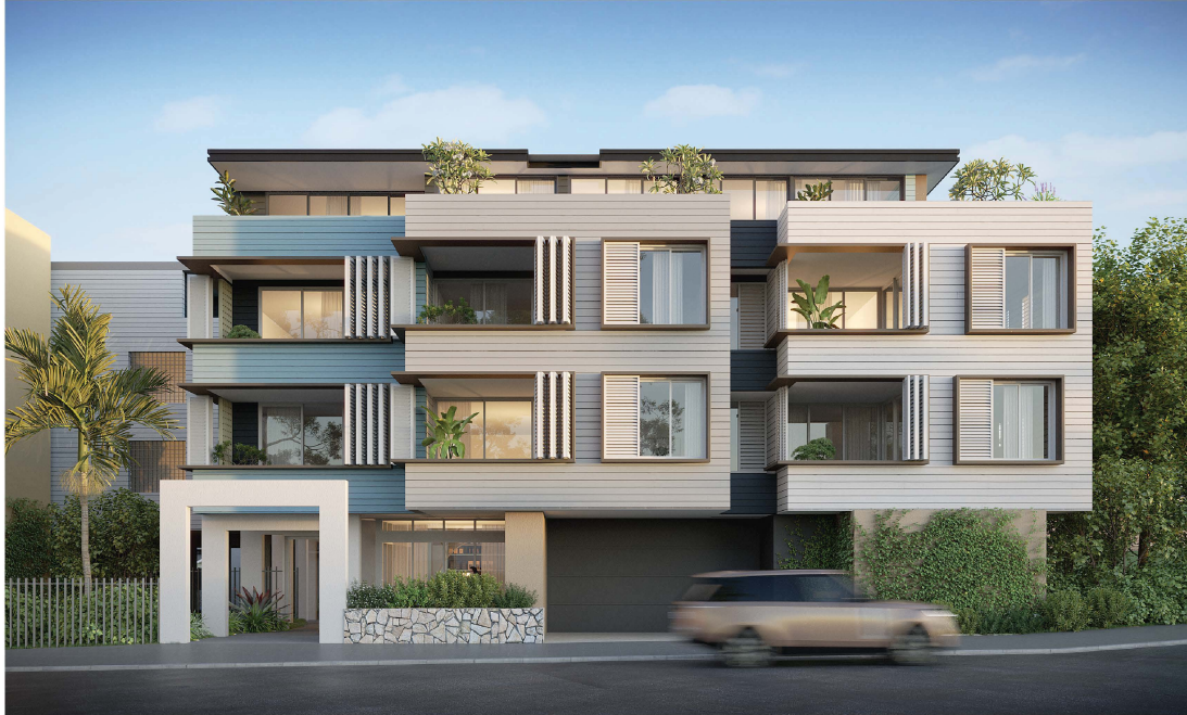
An artist's impression of the "Bathers Collaroy" redevelopment at Collaroy, looking south on Collaroy St.