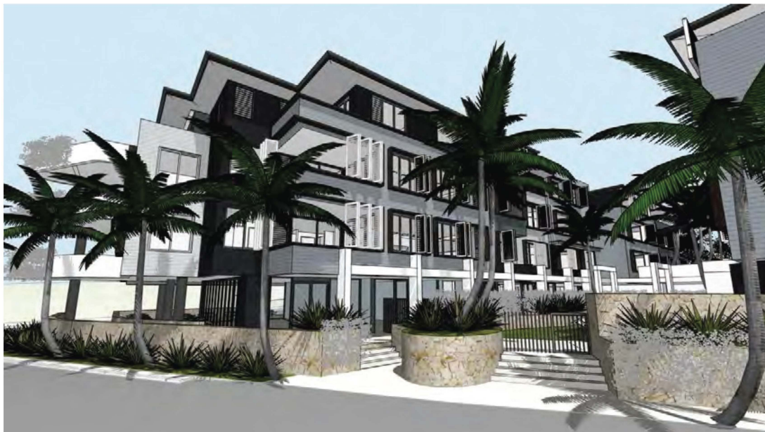
An artist's impression of the "Bathers Collaroy" redevelopment at Collaroy, looking at the entrance between the two buildings to the communal area and retail space on the Alexander St side of the redevelopment.

In April 2020, the Manly Daily reported that police and council rangers visited the hostel after reports guests were holding parties on the terrace.